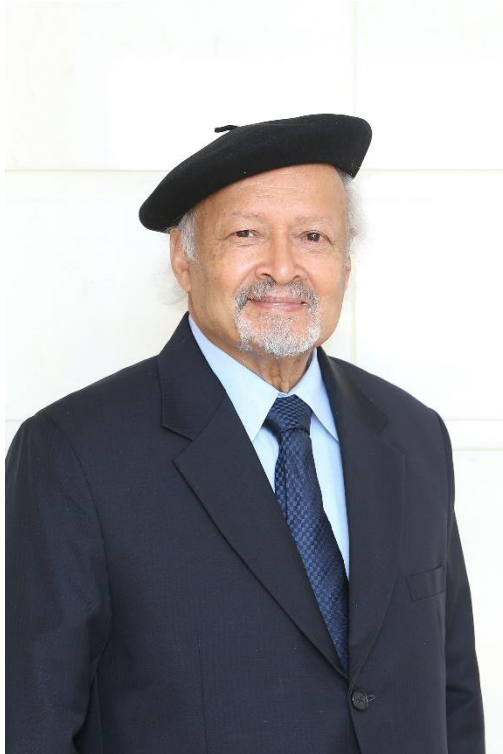
1) Thomas Kailath, Professor Emeritus, Stanford University, USA (10 minutes)